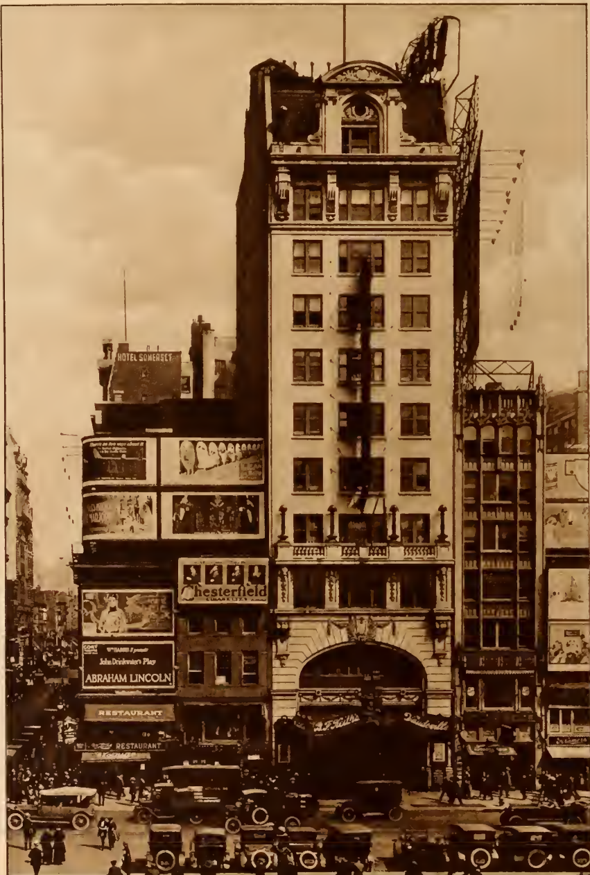
B. F. KEITIP'S PALACE THEATRE, situated on Broadway near 47th Street. This theatre is the home of the best vaudeville. It has a seating capacity of 1800.